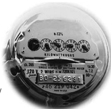
Typical utility socket-type meter.