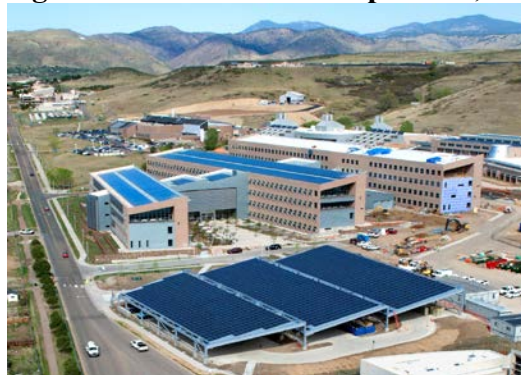
Figure 2. RSF and RSF Expansion, May 2011

During construction of the RSF, the 2009 American Recovery and Reinvestment Act (ARRA) injected additional funding into the project to add a third wing expansion. An additional 138,000 ft 2 of office space for more than 500 NREL employees, including NREL executive management, were added. The RSF north wing expansion will be completed by the same design-build team, with substantial completion in fall 2011. Figure 2 shows the north wing expansion construction progress from May 2011.