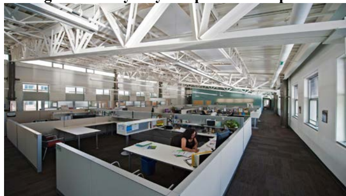
Figure 1. Fully Daylit Open Office Space

The RSF is a recently completed 220,000-ft 2 headquarters and administrative office building with a corporate-scale data center. It showcases cost-competitive, marketable and sustainable, high-performance design that incorporates the best in cost-effective energy efficiency, environmental performance, and advanced controls using a whole-building integrated design process. The RSF building showcases numerous high-performance, yet cost-effective energy-efficient design features, passive energy strategies, and renewable energy technologies, as documented at www.nrel.gov/rsf . An interior office floor plan is shown in Figure 1.